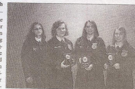
The Milk Quality and Products team at The Eastern States Exposition.

Originally competing at the state competition, held at the Pennsylvania State University in early June, the Milk Quality and Products team took second place overall, which al-