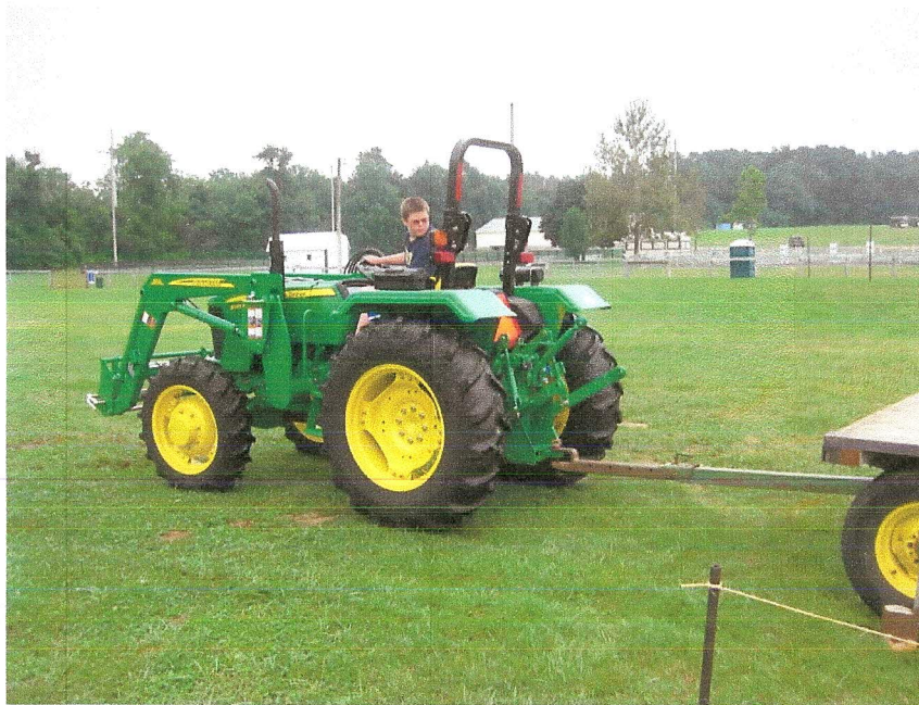
State Tractor and PP Chairman