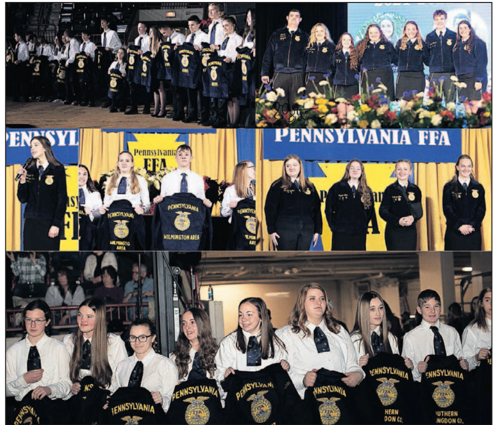
Pennsylvania FFA photos

During this fundraiser, the chapter raised over $5,400. This money will be used for upcoming events for members to attend, greenhouse merchandise intended for resale, apparel, and FFA jackets for members who wish to have the blue corduroy jacket which they can call their own.