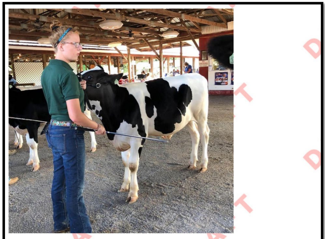
This was my first year showing a feeder calf and I learned a lot about showmanship. Keeping the calf calm is most of the battle when it comes to showing. This picture has me in the show ring during the Shippensburg Community Fair for my weight class evaluation.