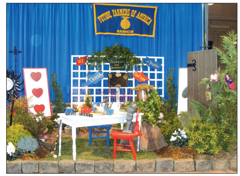
The Manheim FFA entered this garden display at the 2009 Farm Show. Manheim was one of the several chapters to enter the landscape contest.